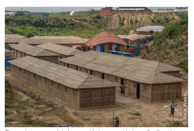
The newly constructed shelters provided accommodation to families who were being relocated from other areas of the camp that were congested or faced disaster-risk.

The primary goal of the project was to increase the capacity of the camp, accommodating families relocating from more congested, at-risk areas. The project also presented an opportunity to develop integrated shelter designs and site planning standards that could be followed for the eventual redevelopment of the entire camp. The Government restricted the use of permanent materials, as the camps are deemed to be temporary. Therefore, the Shelter/NFI Sector approach for the new areas was to construct Mid-Term Shelters.