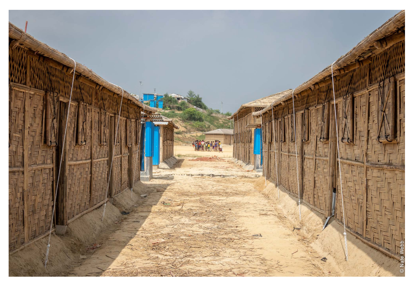
Planning for Mid-Term Shelters was done as part of an integrated site planning and site development approach that ensured space was also provided for infrastructure, community facilities and open areas.

All the construction techniques, for both shelter and site development activities, were based on local common practices, well known also among the refugees. Skilled laborers were identified from within the camp to act as supervisors and to carry out the various skilled tasks. The shelters, and the civil infrastructure of the settlement were 100% built by the refugees themselves through Cash-for-Work, providing an important livelihoods support to the community. This opportunity was extended as widely as possible by systematically rotating laborers every 15 days.