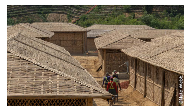
Mid-Term shelters were constructed in the valley areas.