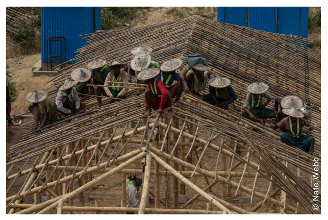
All shelters were constructed by teams of camp residents through Cash-for-Work.