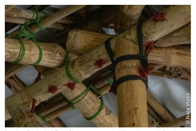
Bamboo for the Mid-Term Shelters was supplied from the camp's Bamboo Treatment Facility.

Post Distribution Monitoring confirmed a high level of satisfaction with the shelters. The next stage of the project will be to replace the 1300 temporary shelters that were built on the surrounding hilltops when this area of the camp was first settled, in 2018.