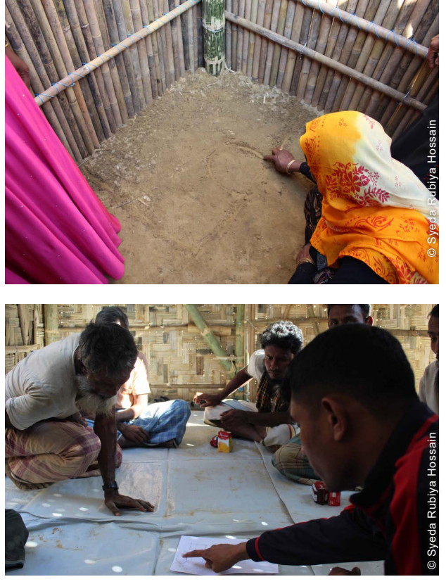
Focus Group Discussions ensured that the inputs of camp residents directly fed into the design of the Mid-Term Shelters.