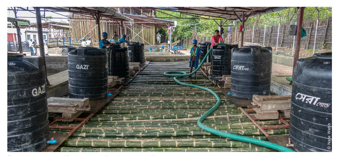
The orthoboric solution used for the treatment of bamboo was selected for its ease in processing and its non-toxic nature.