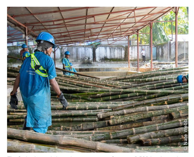
The facility has a daily production capacity of treating 2,500 bamboo poles.

Dec 2020: 500,000 large bamboo poles treated to date.