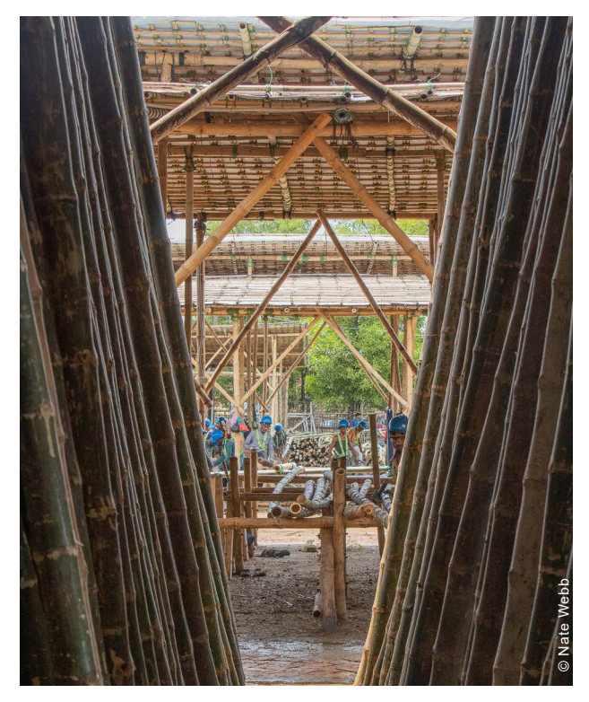
When in full production the treatment facility employs 440 laborers, all from the host community.