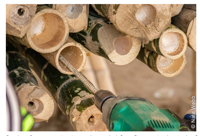
Bamboo for construction is mostly supplied from Rangpur in the north of Bangladesh.

The initial response had significant impact on the bamboo supplies of Bangladesh. As the program has continued, efforts have been made to purchase bamboo in the appropriate season. The treatment of bamboo will extend the lifespan thus further decreasing the impact of the response on the bamboo forests and groves of Bangladesh.