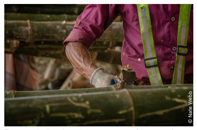
The program has been designed to integrate a range of environmental sustainability considerations, including a strong focus on the sustainability of the bamboo supply chain in Bangladesh.

Additionally, the program provides regular income for host community members.