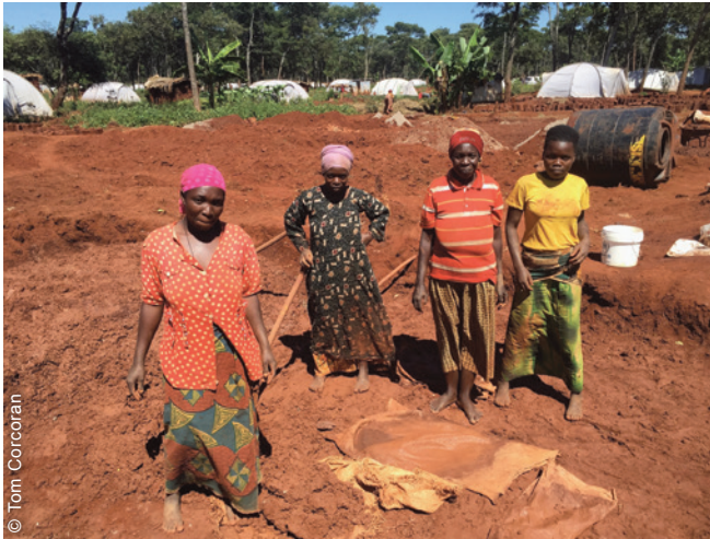
Women were involved in mixing clay, lime and sand (Nduta camp pilot project).