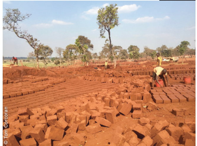
The process of adobe brick making in Nyarugusu refugee camp managed to produce a total of over 11 million bricks, used for the construction of the shelters.