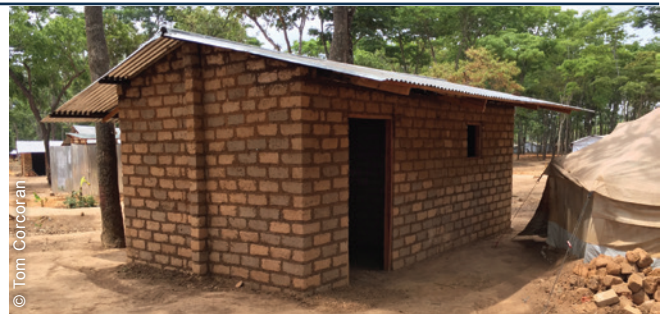
Lime-stabilized transitional shelters were built in Nduta refugee camp. The emergency shelter solution (tent), where the family was living during the construction, can be seen on the same plot near the shelter.