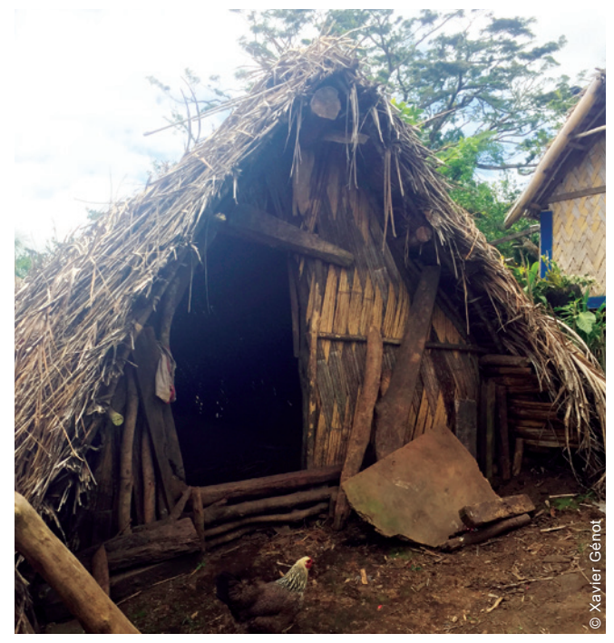
Most of the housing in Vanuatu was built according to vernacular techniques.

natural disasters, and this approach should be at the core of shelter response and preparedness. It would also help to learn from and support the reactivation of traditional knowledge, that is eroding due to a combination of factors, such as migration, urbanization and the passing away of elders.