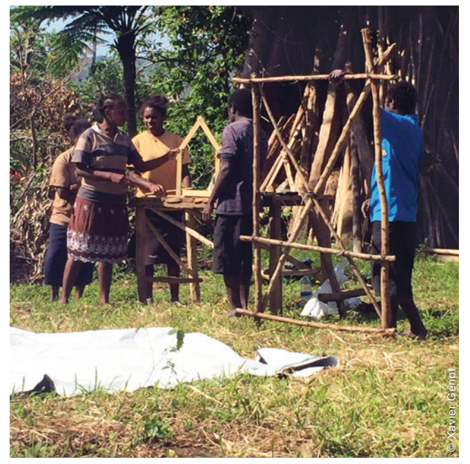
Cluster partner agencies conducted Build Back Safer shelter awareness sessions across communities, such as this one in Tanna.

In respect of the "do no harm" principle, humanitarian agencies did not build houses, but instead provided safe-shelter awareness and materials that explored ways in which modern construction can learn from, and be strengthened through, the lessons from the past. This also aimed to reactivate the fading knowledge for the new generations.