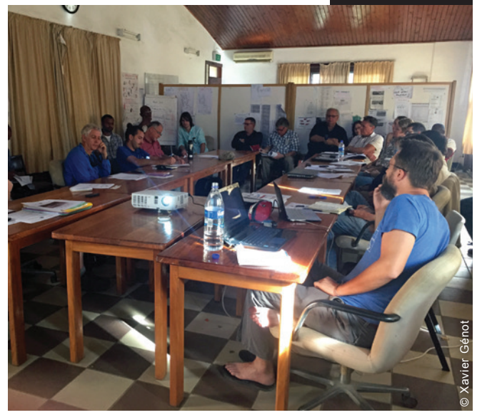
The Shelter Cluster had a Technical Working Group focusing on Build Back Safer awareness and developing a training framework with Vanuatu vocational training institutions.

Lessons from the response to cyclones Pam in Vanuatu and Winston in Fiji<sup>5</sup> demonstrate that promoting Build Back Safer is critical to strengthen long-term resilience to