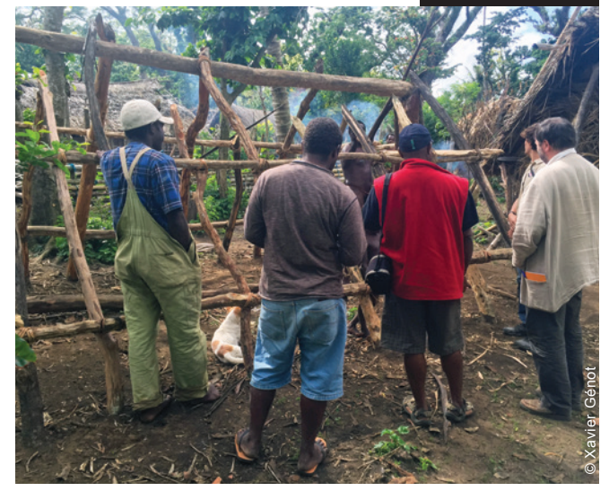
Assessments of vernacular architecture were conducted in indigenous communities (here, in Tanna).

Unsurprisingly, the buildings that suffered the most damages were those outside traditional communities – mainly in informal settlements – that were made of mixed traditional and modern materials and incompatible construction systems. After Cyclone Pam, many of these were being rebuilt the same way as before, thus recreating (when not exacerbating) the same hazard vulnerabilities, due to a lack of proper materials, building know-how and financial resources<sup>2</sup>.