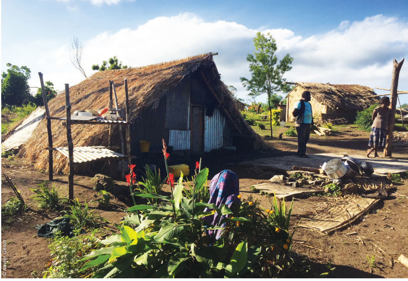
Households are composed of at least two dwellings, and include shared kitchens and communal gardens. Recovery had to take into consideration all these elements, not only one shelter.