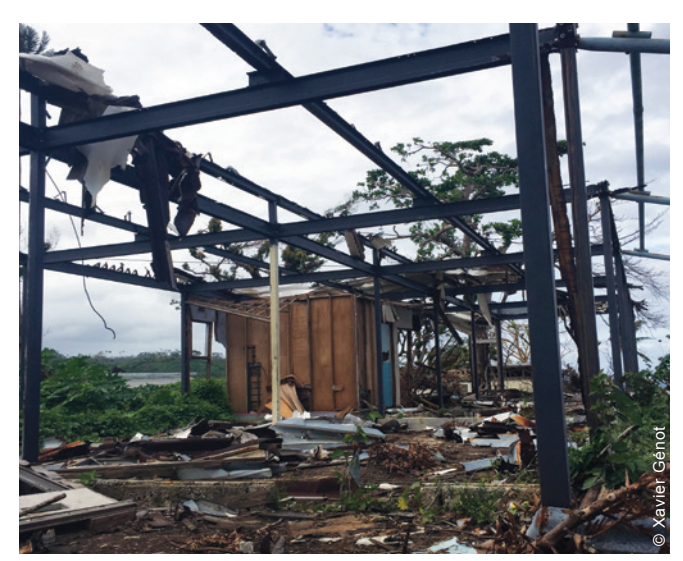
The cyclone affected public buildings as well as private ones.

17 Aug 2015: Shelter Cluster response evaluation to inform the effectiveness of the shelter operational response and the recovery and preparedness strategies following Cyclone Pam.