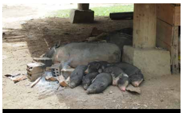
"Livestock have been sheltered within household infrastructure for hundreds of years." Top to bottom: European farmhouse with space for cattle underneath. Goat shed attached to main house in Sri Lanka. House in Vietnam with pigs sheltered under the raised floor.