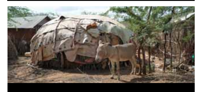
In Dadaab, Kenya, there are restrictions on livestock, but they remain an important livelihoods asset.