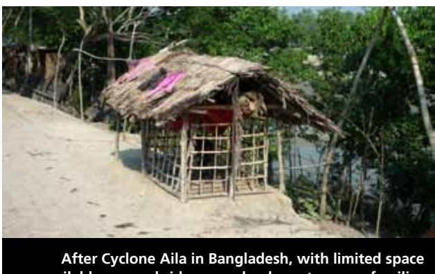
After Cyclone Aila in Bangladesh, with limited space available on road sides or embankments, many families prioritised secure shelter for their livestock.