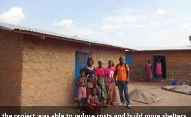
By using mud and other local resources, the project was able to reduce costs and build more shelters.