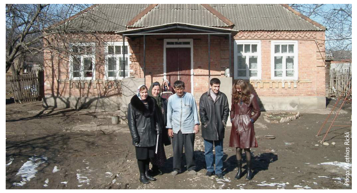
By supporting host families with one off cash grants, the project aimed to avoid evictions.

IDPs, monitoring teams were sent to the registered beneficiaries' address.