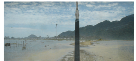
Road shown two years after the tsunami. Access was initially difficult along much of the west coast of Aceh.

As part of the agreements reached with the communities, the first semi-timbered shelters, which had provided transitional shelter for as long as two years, were upgraded at the NGO's expense once all shelters had been completed.