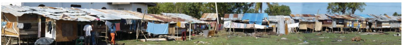
Many people built their own shelters using reclaimed materials.

In 2006, as local community contractors and other NGOs became