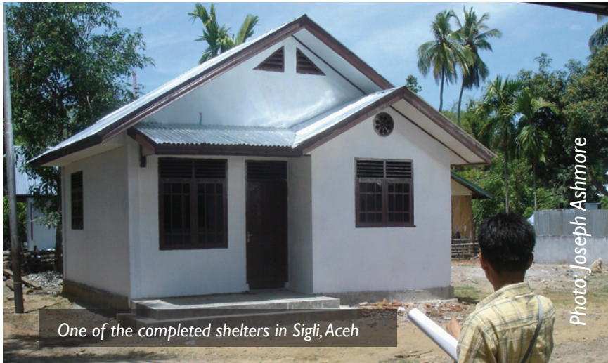
One of the completed shelters in Sigli, Aceh

available in Aceh, the NGO started to work with implementing partners in the local community and contractors to construct the remaining houses. They were finally able to complete construction by the spring of 2008, just over three years after the tsunami.