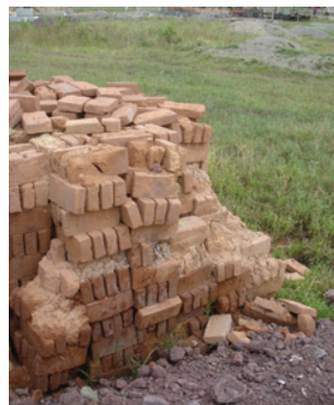
Obtaining good quality building materials remained problematic. These bricks decayed rapidly in the rain.

The availability of materials strongly impacted the shelter designs used. There were significant challenges in