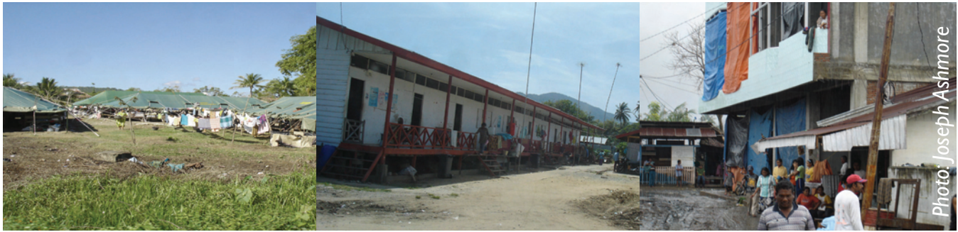
In the first weeks after the tsunami, people found shelter in large collective tents (left), squatted buildings (right), tents, rented housing or with friends and family. The government built transitional living centres (centre).