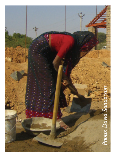
By working through a network of local NGOs, it was possible to mobilise large numbers of people.