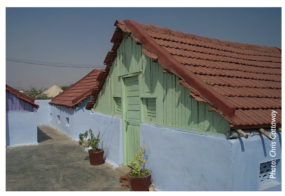
These school buildings were adapted from the transitional shelters. The low walls reduce the risk of masonry falling on occupants during future earthquakes.

'Generally, the concept of working through a local NGO partner is better than working directly, particularly in relief distribution. INGOs have less detailed knowledge about the affected people's needs. On the other hand, NGOs local may the skills to meet donors' requirements. Collaboration between INGOs and local NGOs, thus, is mutually benefiting'.