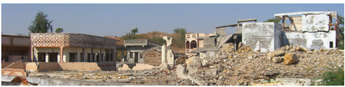
Damage following the earthquake at Gujarat that completely destroyed over 180,000 houses. In the first weeks after the earthquake the organisation distributed non-food items through partners. This was followed by a transitional shelter programme.