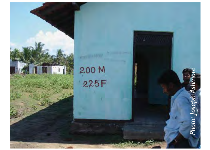
There was no construction allowed within 200m of the hightide mark in some areas and within 100m in other areas.