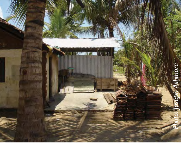
In some cases, small groups of transitional shelters were built on small plots of land that were negotiated on a temporary basis.