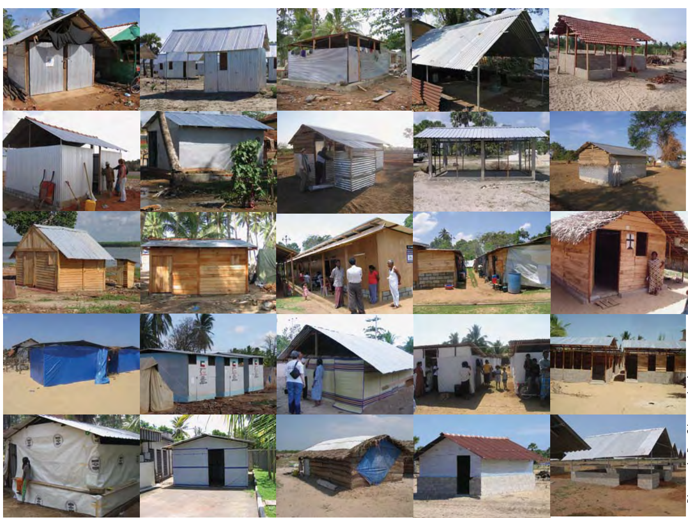
The shelter strategy allowed for many different shelter designs. Over 70,000 transitional shelters were built.