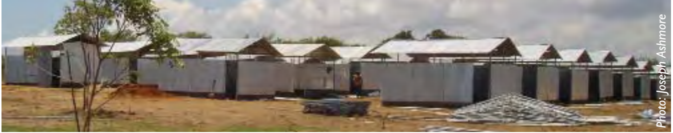
New settlements or camps had to be built for many of the displaced. Many of the allocated sites were prone to flooding and away from livelihoods.