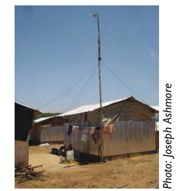
One of many transitional shelter designs adapted by its occupants

Coordination within the shelter sector was generally good, with full participation from the government at both the national and local level. However, in many areas up to 60% of the shelter support was provided by small organisations. Many of these had little previous disaster experience and were often involved for only short periods of time.