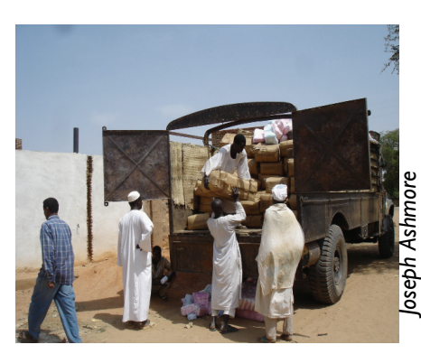
Unloading a lorry of relief items

The situation in Darfur became increasingly volatile throughout 2003, with refugee movements beginning as early as April. The crisis began to escalate at the end of the year. Response to the crisis in Darfur was hampered by the Sudanese government's restriction of access to the affected areas.