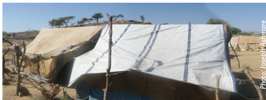
A fly sheet separated from an inner tent and covered with plastic is used to form an extension. Sticks were used to raise the sides to increase the internal volume.

The roof of a hudno uses a lot of wood - the roof frame is covered by more wood with a layer of mud on top. The walls are generally made of stone, often using mud as mortar.