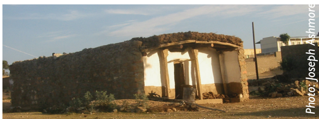
Traditional hudno house with earthen roof