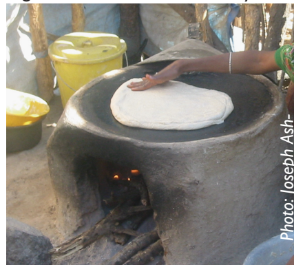
Firewood collection led to serious conflict with the host community. Because traditional stoves were not very efficient, an improved stoves project was set up.

In 2002, the organisation began the distribution of fuel-efficient stoves and kerosene stoves, significantly decreasing the demand for fuel wood by IDPs.