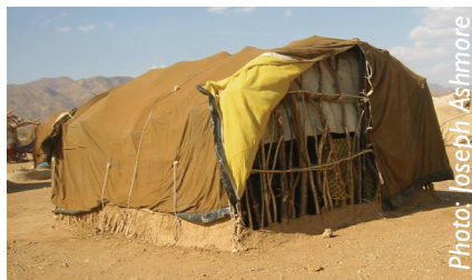
People upgraded their tents using local materials to provide more head room.

uses and to decrease the footprint of the tent. Shortening the guy ropes meant that the wall height shrunk to around 30cm, reducing the internal volume of the tent considerably.