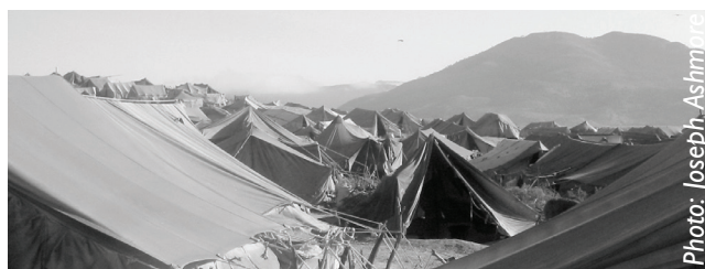
Over 60,000 people were living in tent camps six years after the outbreak of conflict.