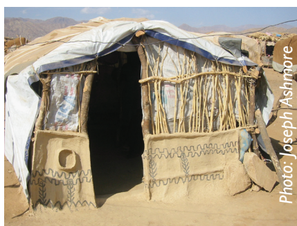
People adapted their tents in many ways.

* Where there is no data, cells are left blank.