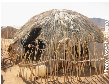
Palm leaves were distributed to 1,000 families.

With IDPs living in camps for much longer than expected, additional pressure was placed on natural resources in the area. IDPs and the host community were soon competing for scarce firewood and large areas of land near the camps were deforested.