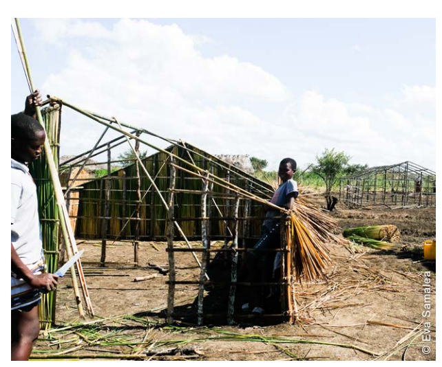
Support was provided to households building their own shelters using locally available materials. This included trainings and awareness raising on more resilient construction techniques, and on mitigation of the potential negative environmental impacts of shelter construction.

Beyond the basic ES/NFI kits and construction tools that were provided, supporting organizations also provided trainings. Awareness on proper use of natural resources and technical guidance for building more resilient shelters was aimed at increasing effectiveness of the response, and mitigating the environmental impacts related to emergency shelters interventions (such as deforestation and soil degradation).