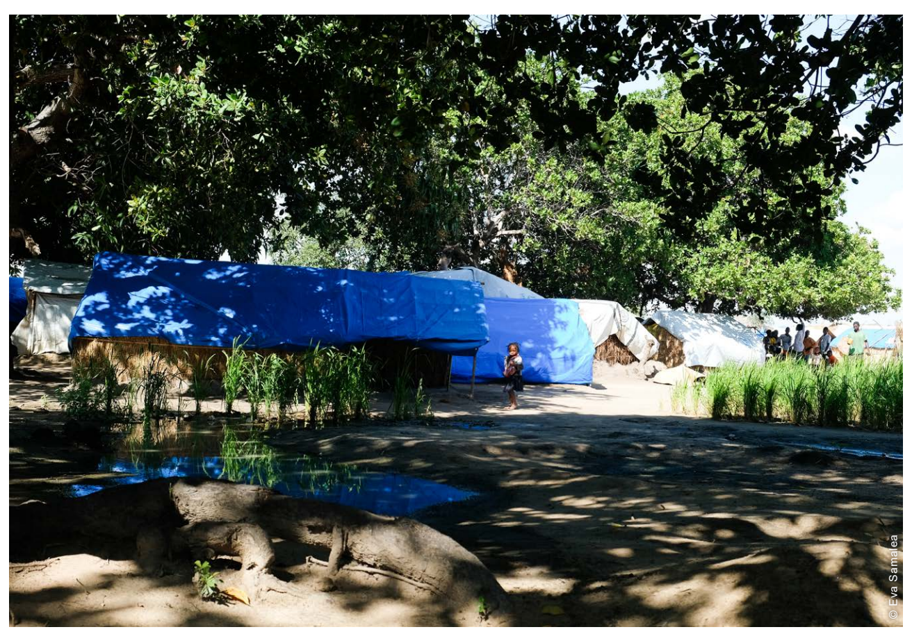
During 2020, the conflict in the north of the country expanded and displacement increased rapidly. Many displaced people moved to temporary sites, such as this one in Cabo Delgado.