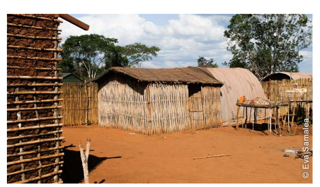
Shelter phased approach development by one houshold in Meculane Relocation Site, Chiure, Cabo Delgado.

One key aspect of HLP in Mozambique is that community land rights through occupancy are often not formally registered and are thus "invisible" in formal records and official maps. Parallel informal property systems exist in periurban and rural settlements. In this context, conducting "due diligence" processes to understand the tenure of land for humanitarian interventions (such as shelter and the construction of infrastructure) is very important. The Cluster actively trained partners on approaches to addressing and conducting due diligence on land ownership.