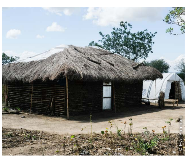
Emergency Shelter and Semi-Permanent Shelter (self-built) as part of the upgrade strategy within the same household, Ntokota Relocation Site, Metuge, Cabo Delgado.