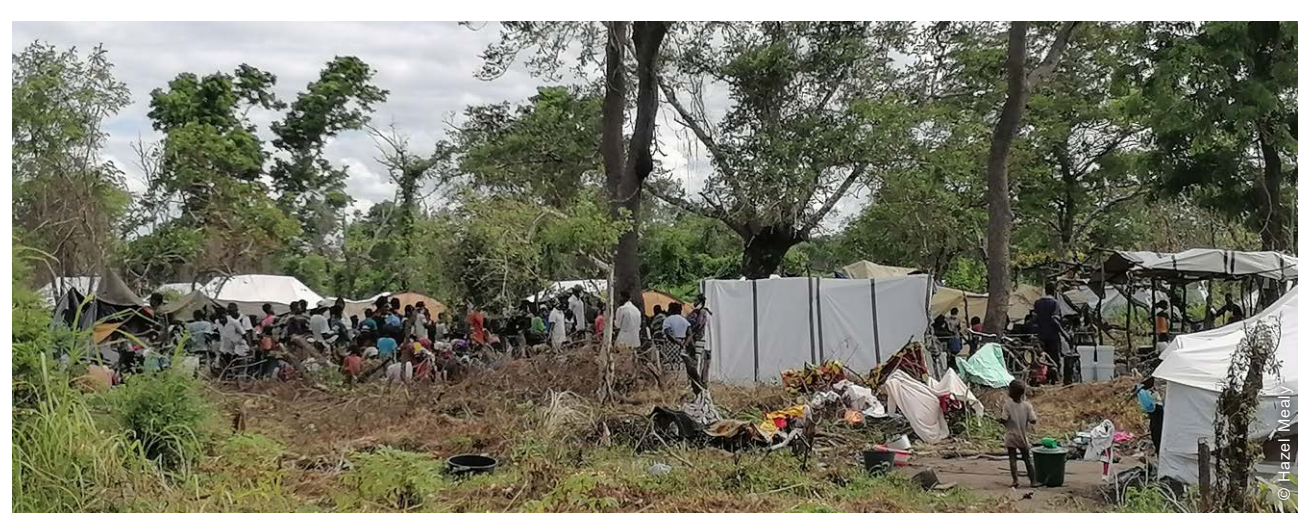
Four major cyclones and tropical storms have struck Mozambique since 2019. This photo shows people displaced following Cyclone Eloise in 2021 which made landfall close to where Cyclone Idai had struck in 2019.

On top of the conflict, on the 30<sup>th</sup> December 2020, Tropical Storm Chalane struck in the Central Region of Mozambique. It hit locations where approximately 90,000 displaced people from Cyclone Idai were living in resettlement sites. Overall the storm affected 86,412 families (441,686 people). The most vulnerable people, who were unable to prepare/upgrade their shelter ahead the storm, were the most affected. Tropical Cyclone Eloise then struck on 23<sup>rd</sup> January 2021. It affected an area to the south of the conflict, making landfall near where the 2019 Cyclone Idai had struck. It landed as a Category 2 Tropical Cyclone.