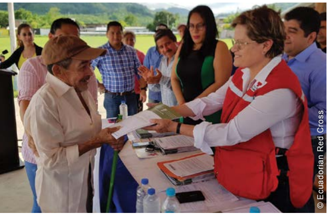
In the recovery phase, the lead organization of the HLP group provided support to families to access land titles.

Supporting the legalization process and jointly advocating to local governments resulted in the lead organization delivering the first legal title to an affected family almost one year after the earthquake. By March 2019, 420 families had benefited from the land legalization process, as part of the recovery programme of the organization. However, other actors did not conduct regularization projects.