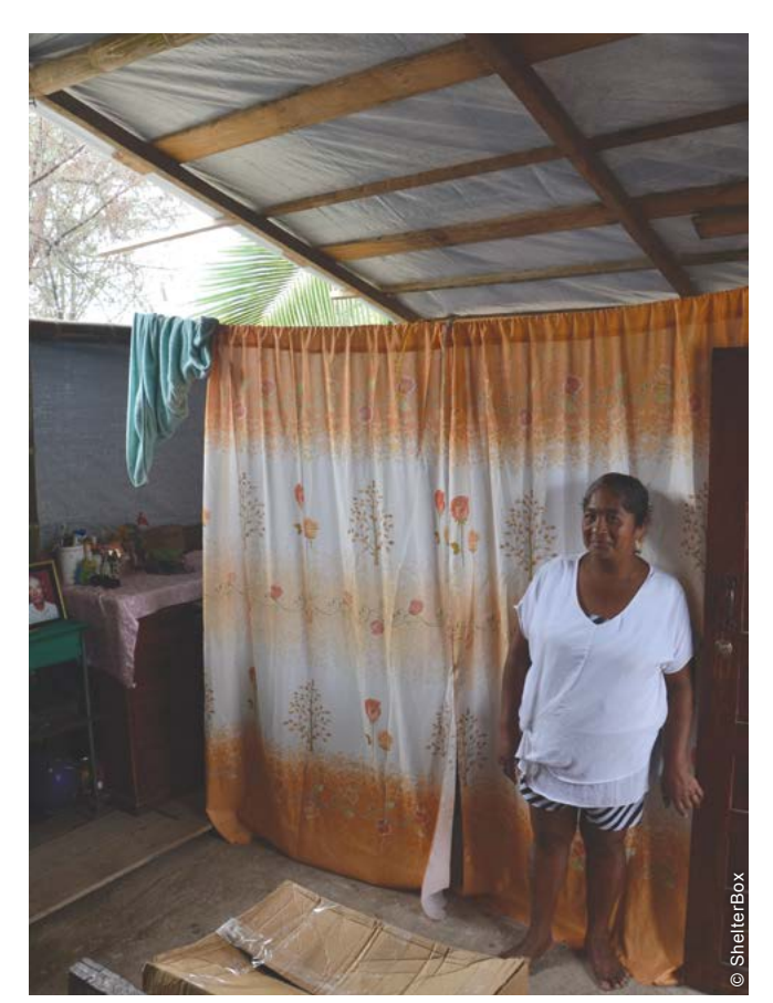
The project highlighted the need to advocate to national governments to include regulations and protections for people affected by disasters, and allow humanitarian actors to assist those without legal land titles.

At the time of writing, the lead organization – in partnership with a local university – was planning a new project to influence public policy around land issues after disasters. As exit activities, the organization also planned to implement HLP workshops for community leaders.