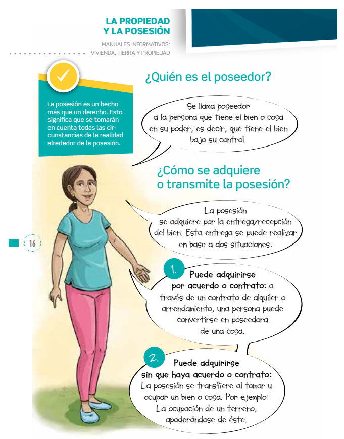
Booklets were produced on key HLP concepts to inform communities of their HLP rights and responsibilities.