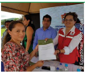
The project combined research and advocacy in the early phases, with direct support to communities to access secure land tenure in the recovery phase.