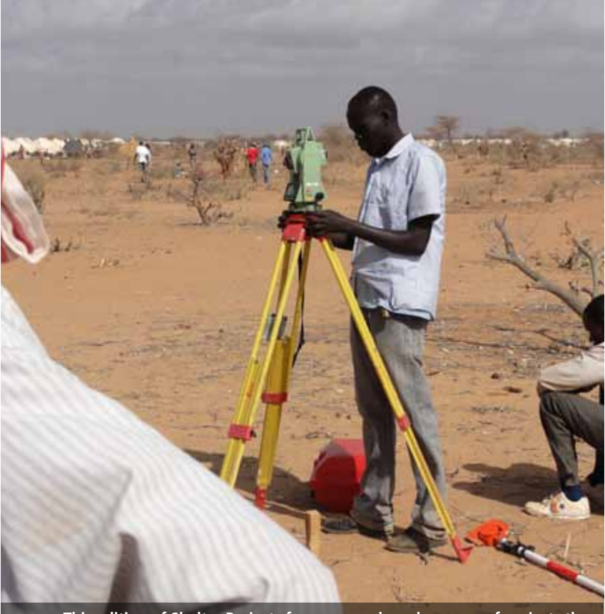
This edition of Shelter Projects focuses on a broader range of projects than previous editions - such as A.15, Kenya (Dadaab), which includes site planning.

In the case studies, we include some findings from a 10 year evaluation of a transitional shelter project (A.7 – Democratic Republic of Congo – 2002). We also include a case study from 1871 that illustrates the long history of shelter projects ( A.32 – USA (Chicago) – 1871), and contains an early design for a t-shelter / core house.