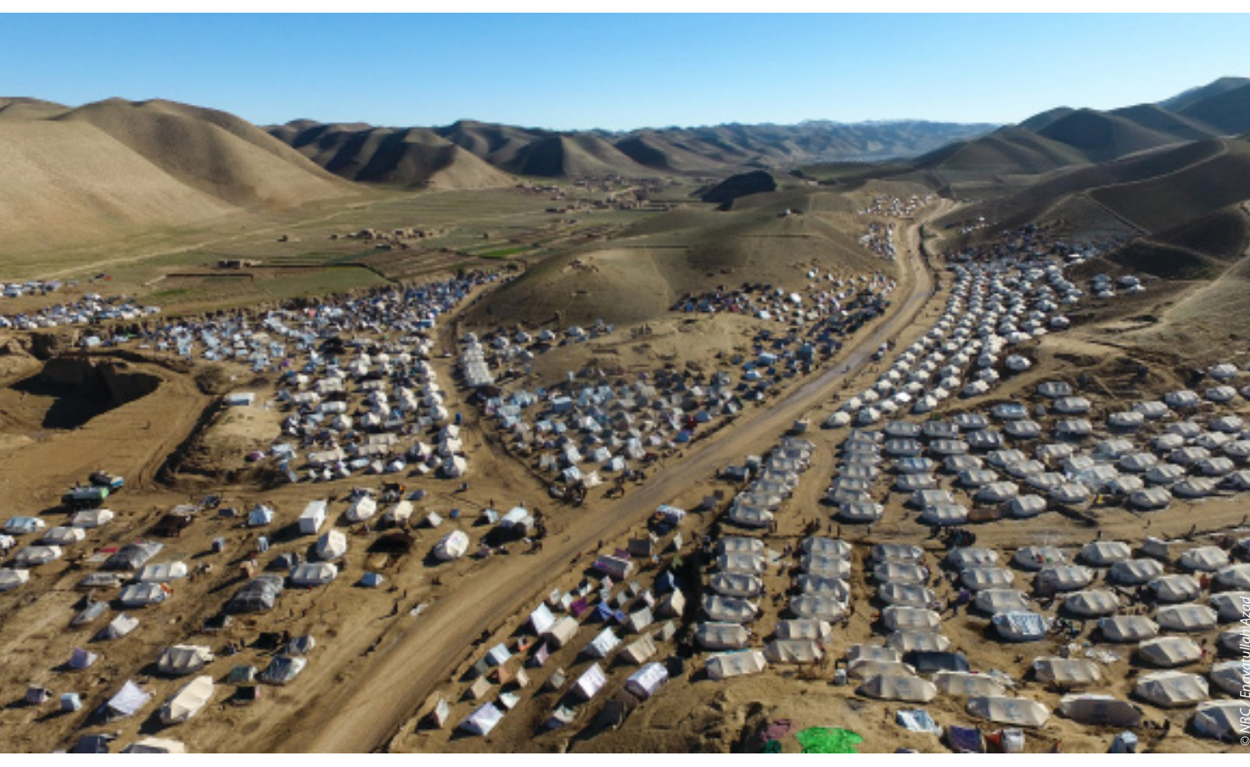
Baghdis drone footage.